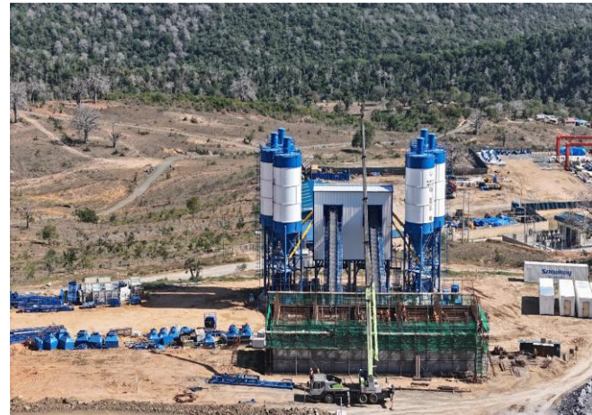
Preparatory works-Batching Plant No. 3 plant