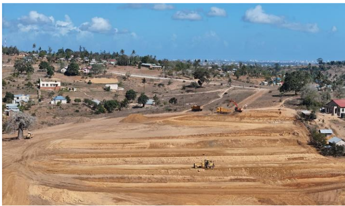
Ongoing site clearance at new Fulugani Primary school in preparation for commencement of construction works