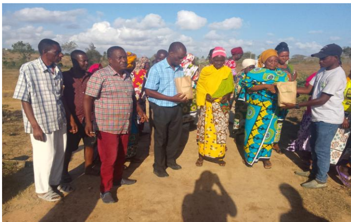
WRA Mombasa office, in collaboration with Furaha and Baraka Farm, distributed 2kg of pigeon pea seeds to 45 farmers from each of the four WRUAs—Mwachiga, Mazola Mienzeni, Mwang'ombe Ngoni, and Upper Mwache