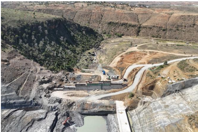
Main Dam: Excavation and Slope Protection Completed