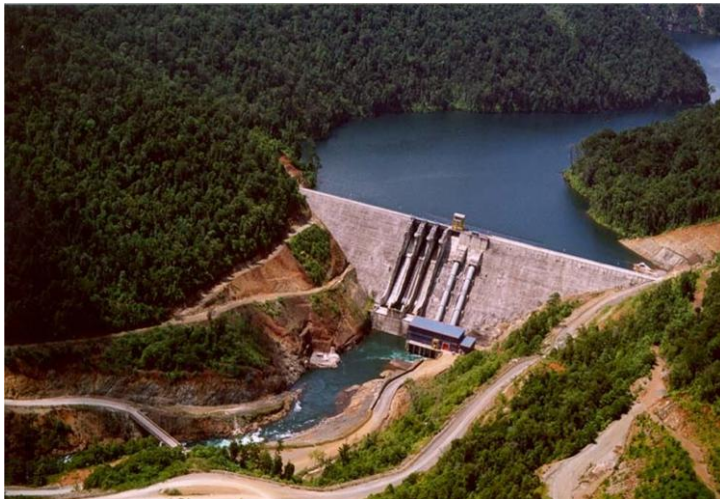
Comparative photo of the Mwache Dam on completion

The dam site is located across the Mwache River at Fulugani village in Kinango Sub-County, Kwale County, approximately 22 km west of Mombasa. The Coast Water Supply Master Plan identified the dam as the most preferential, viable, and necessary long-term solution for water supply to Mombasa and Kwale counties.