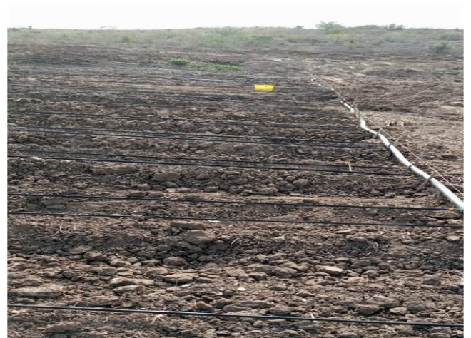
Ongoing FLID Chikwakwani demonstration farm