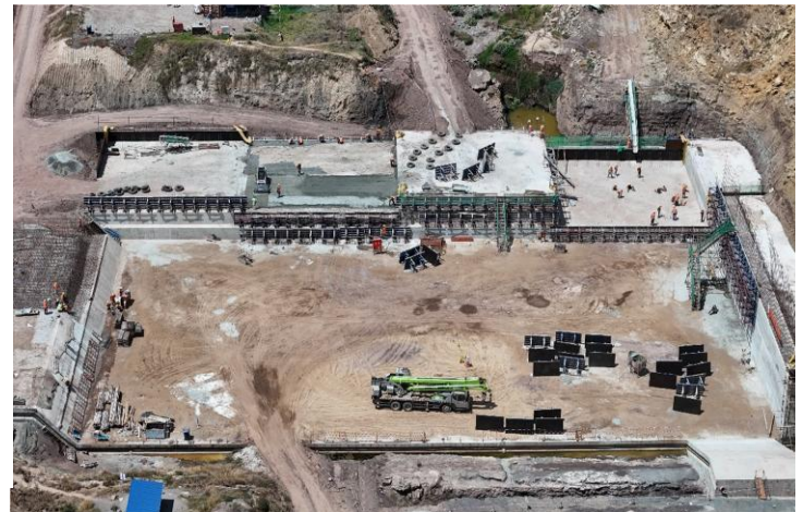
Lower Check Dam