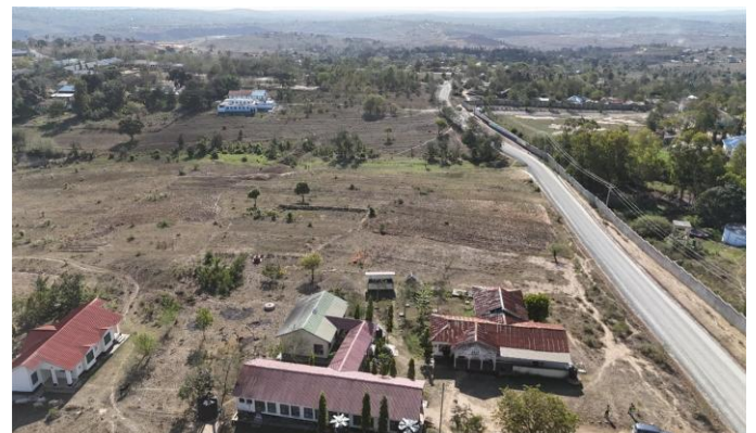
A section of community Road E1