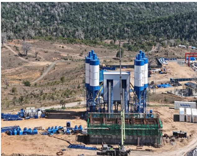
Preparatory works at batching plant no.3